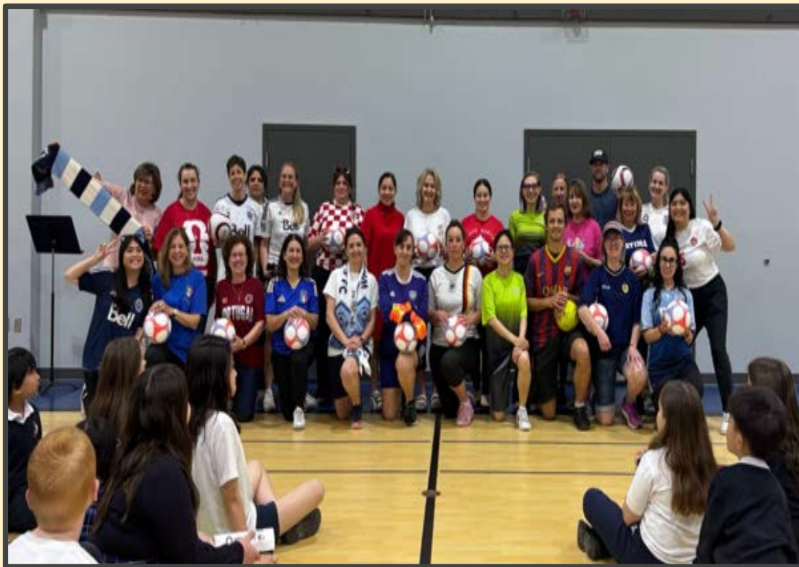
The teachers involved in the Fatima FIFA Pre-Fun Day pose for a photo before the games begin.