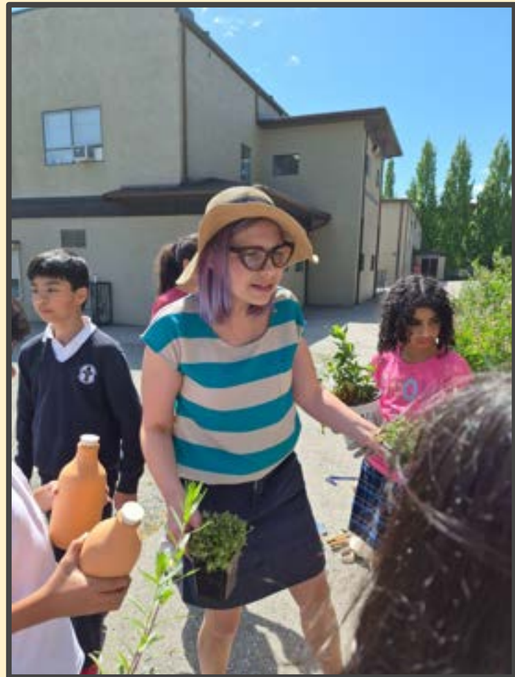
The eco kids busy preparing a beautiful school garden.